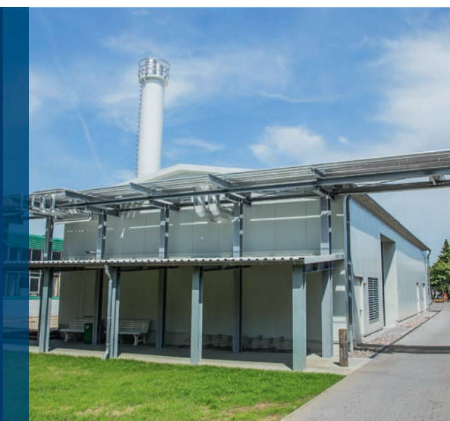
Exterior view of Valenzi's boiler house

AME-TECHNIK Arendt, Mildner & Evers GmbH Reichardstraße 6 31789 Hamelin, Germany Tel.: +49 5151 9568-0 Fax: +49 5151 9568-12 E-Mail: kontakt@ame-technik.de