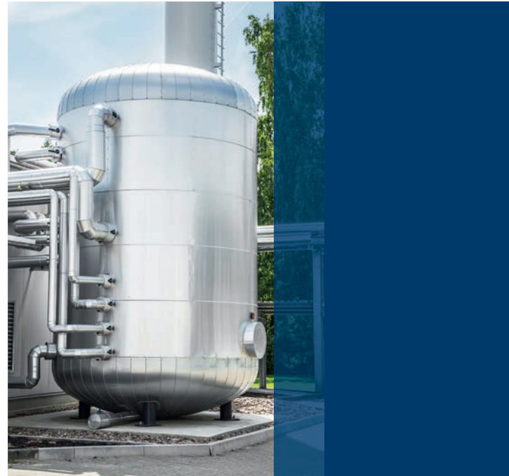
The waste heat from the compressors and cold stores is buffered in the heat storage tank

water for production and cleaning purposes. If the thermal quantity in the storage tank is not sufficient, it is supplemented by steam post-heating.