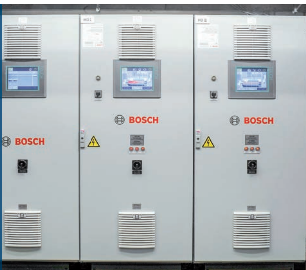
The intelligent control technology enables the optimum control of the boiler plant and provides reliability of supply

Low-emission natural gas is used to fire the two boilers. In addition, light fuel oil is available for one boiler. Given the wide control range in gas operation, the burner output can be smoothly adjusted to the actual steam requirement. The switching frequency of the burners is strongly reduced. Energy losses caused by pre-ventilation of the flue gas channels are reduced.