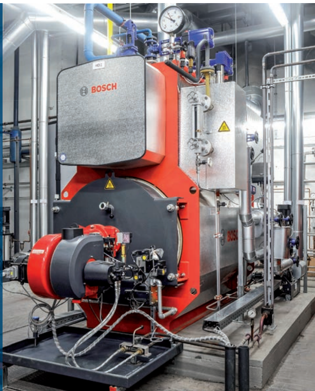
The compact steam boiler U-MB with an economizer and fired with natural gas