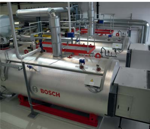
The modern Universal steam boilers UL-S with oxygen and speed-regulated natural gas firings.

The new boiler system technology from Bosch permits energy-efficient and environmentally-friendly steam production. The efficiency of the overall system was improved by approximately 20 percent, the CO 2 and NO x emissions have reduced accordingly. The installation of the boiler system was entrusted to the experienced plant construction company AGO AG Energie + Anlagen from Kulmbach. The boilers were commissioned by Bosch Customer Service.