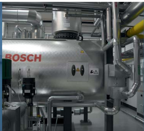
The water service module WSM-V for feed water treatment and degassing.