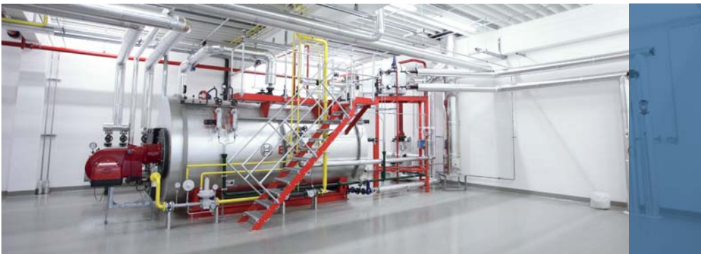
The new steam boiler ULS in Haribo's Hungarian plant.

The new system has a steam capacity of 4 000 kg/h. It is efficient to operate and features intelligent control functions. In addition, coordinated components help to keep energy usage and CO 2 emissions to a minimum. The integrated economiser uses the hot flue gases from the boiler to preheat the feed water, reducing fuel demand and flue gas losses. The use of flue gas condensate using the downstream stainless steel condensing heat exchanger also contributes to an increase in efficiency. The perfectly coordinated natural gas firing system provides for particularly low-emission combustion.