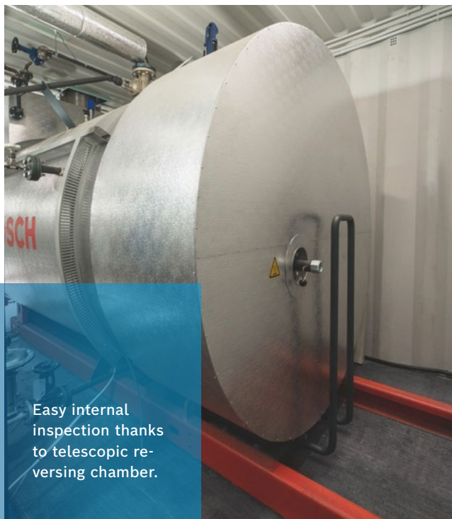
Easy internal inspection thanks to telescopic reversing chamber.

and, in the second step, manufacture panels, moulded parts and blocks. To ensure that the steam generation runs smoothly, the boiler is equipped with the CSC compact control. It automatically regulates the output and the water level in the boiler, for example. Thanks to its ease of use, all relevant operating parameters can be quickly called up via a touch display. An additional innovative characteristic of the compact boiler is its telescopic reversing chamber. Without inserts in the flue gas routing, it is significantly easier to access for maintenance measures and cleaning. The regular internal inspection of the pressure vessel can be carried out in a cost-optimised way with small effort. In the end, Lippstädter Hartschaum had to leave only a little more space in the container to be able to open the reversing chamber. With its special Bosch insulating concept, the reversing chamber is designed for life-long operation. Thanks to the insulating effect, its surface barely becomes warmer than the ambient temperature during operation. This also contributes to the high overall efficiency.