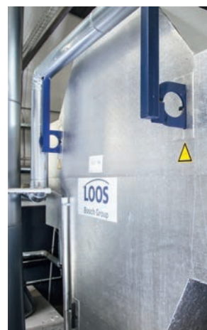
Separate flue gas heat exchanger connected downstream of the fourth smoke tube pass to provide maximum efficiency