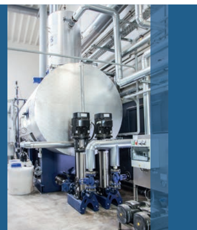
Fully-automatic water treatment via the WSM-V water service module