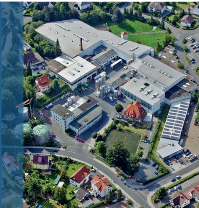
Aerial view of the Immergeut dairy in Schlüchtern

On-site power generation with the CHP unit in conjunction with waste heat exploitation by the high-efficiency waste heat boiler leads to a considerable increase in efficiency in comparison with separate electrical power and heat generation. The ROI (return on investment) for the investment as a whole is less than six years. At the same time, the environment is benefitting from minimised CO 2 and NO x emissions.