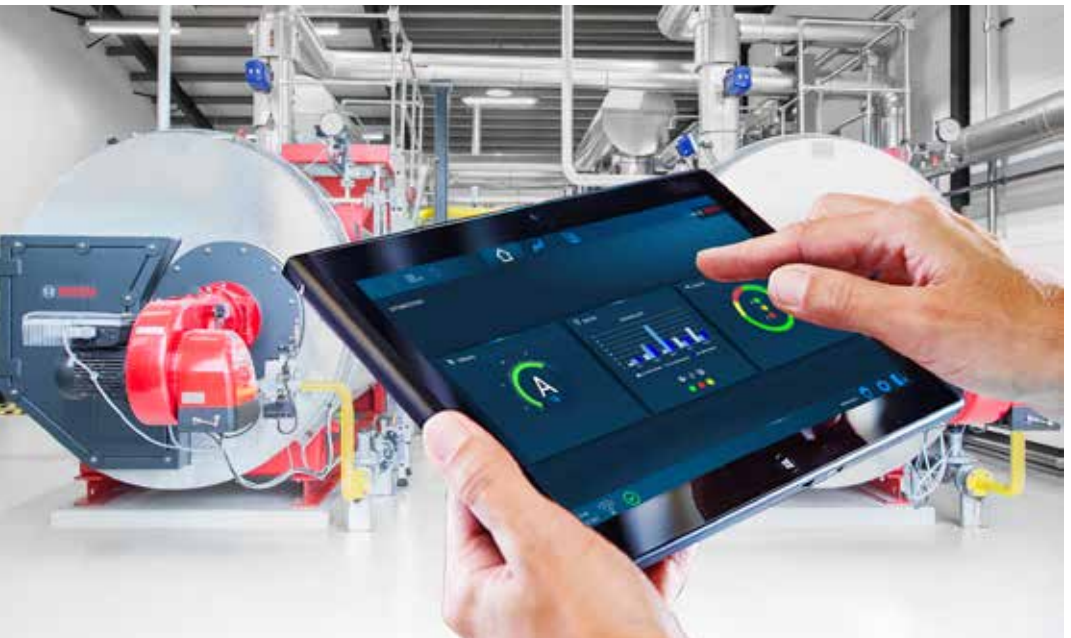
MEC Optimize improves efficiency and availability of boiler systems.

very beneficial and gives information about the operating performance and efficiency of energy-generating systems. With the introduction of MEC Optimize as an addition to our reliable steam and hot water boilers of the highest energy efficiency Bosch Industrial offers an intelligent system for optimizing plant efficiency. The boiler system is either integrated into an existing process control system by means of state-of-the-art control technology or can be visualized on any conventional desktop PC/tablet.