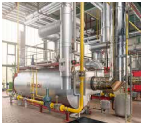
The Bosch UT-L heating boilers perfectly complement the heating network and convince through their high efficiency.