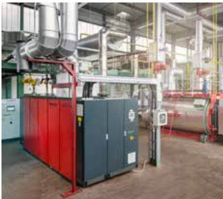
The Bosch CHP provides the base load for heating and at the same time electrical power for the company's own consumption.

Most of the heat at KSB was originally generated by two steam boilers manufactured in 1974, each with an output of 9.3 MW. The steam was converted to hot water by a downstream converter. An analysis showed that significant energy savings could be achieved by replacing the old boilers and changing to hot water operation. The maximum temperature requirements of the consumers are 100 °C and can easily be met by a hot water heating system. Furthermore, the existing system had in the meantime become considerably oversized for the actual energy needs. The base load for heating the building and generating hot water is now provided by the gas-operated Bosch CHP unit, which has a thermal output of 500 kW. At the same time around 12 % of electric power demand, e.g. for light, power and processes, is obtained at low cost by own electricity generation. The electrical output of the CHP is nearly 400 kW.